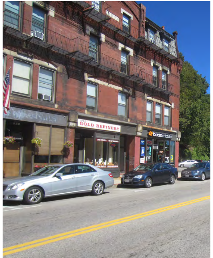
IMAGE 5 On-Street Parking along Main Street

According to evidence derived from the tour and interviews, the existing free municipal parking is heavily underutilized, with an average daily utilization of the parking structures of approximately 50% . It was suggested that poor signage and visibility of the structured parking could be a factor in the low utilization rates. Business owners have also expressed concern over the poor enforcement of on-street parking space limits [two-hours], which allows for long-term parking by employees instead of patrons.