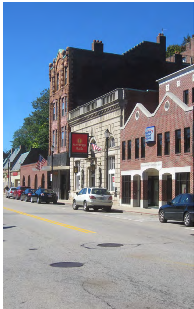
IMAGE 1 Main Street Looking West

and opportunities in the Downtown and lower French Hill Districts. The panelists then engaged in an intensive charrette to develop potential revitalization concepts for the two Districts, as well as “next step” recommendations. The panel presented these to the public that evening. The presentation is available electronically at the ULI Boston website http://boston.uli.org .