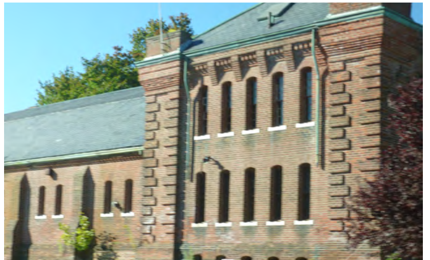
IMAGE 3 Underutilized Armory Building