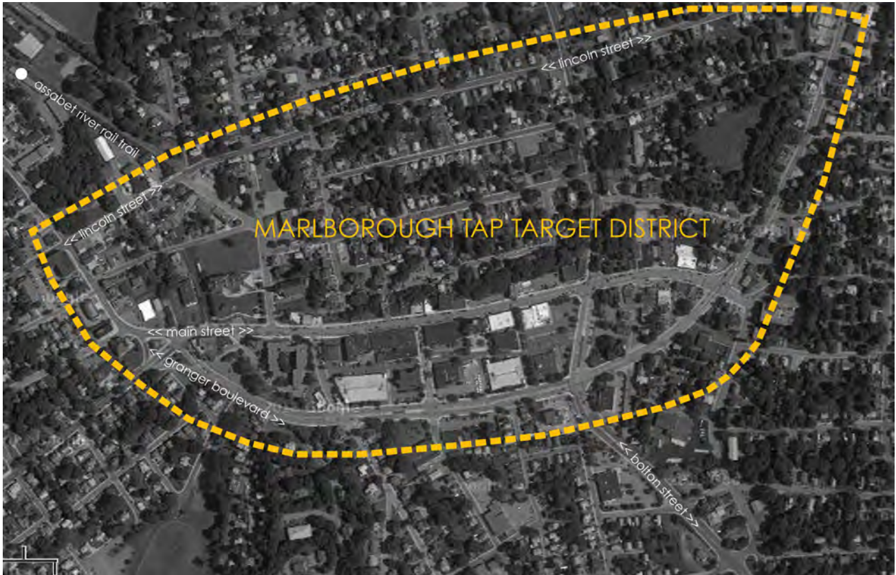
FIGURE 1 Map of TAP Target District

The strategic recommendations range in scope and nature and include physical and streetscaping improvements, and changes in current zoning and policy to help shape appropriate new development initiatives across both districts.