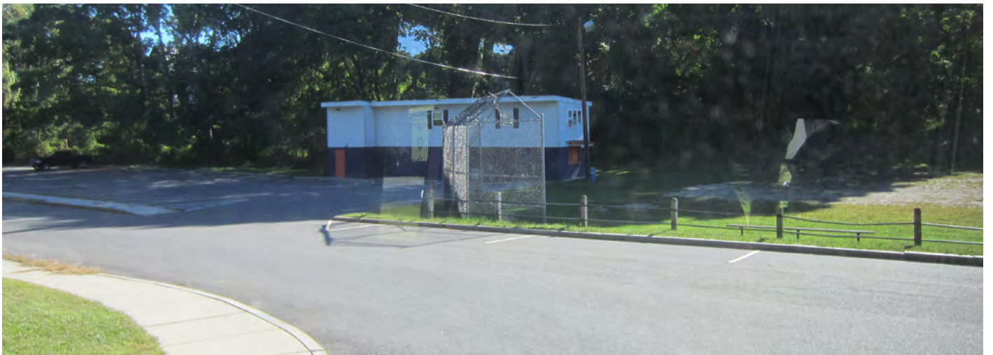
IMAGE 4 Future Site of Senior Center at Ward Park