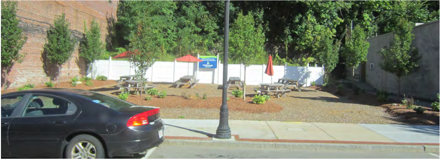
IMAGE 2 Downtown Pocket Park