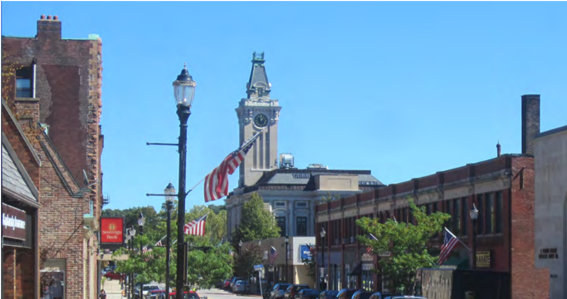
Downtown Marlborough and City Hall