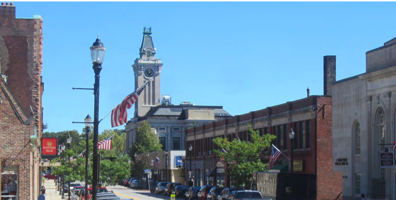
IMAGE 4 Main Street in Downtown Marlborough with City Hall in Background