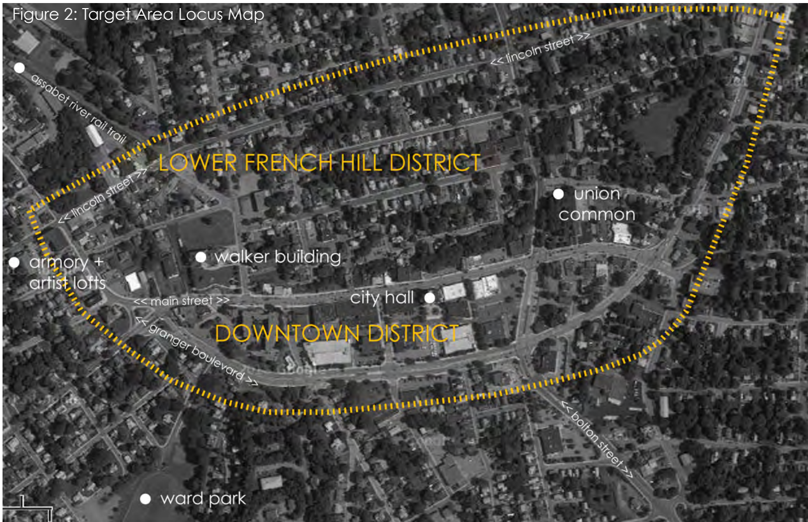
Figure 2: Target Area Locus Map

structures and land remain and represent good opportunities for future redevelopment. For example, the former armory building, located near the intersection of Lincoln and Mechanic Streets, is well-situated and well-suited for a future adaptive reuse.