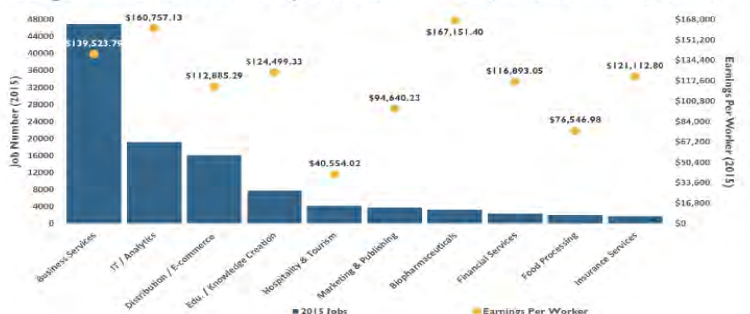
Largest Traded Industry Clusters in 495/MetroWest, 2015

*Infographic and data courtesy of UMass Dartmouth Public Policy Center for the 495/MetroWest Suburban Edge Community